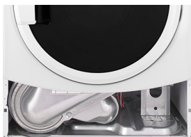
FRONT ACCESS PANEL