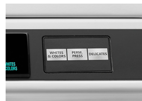
ONE-TOUCH CYCLE SELECTION